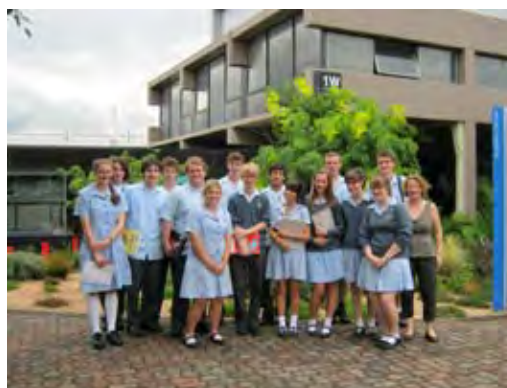
Year 12 Chemistry Students at Monash University 17/02/2011

Finally, may I remind you that subject changes to academic programs need to be finalised by Friday, 18th February.