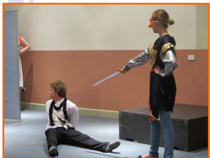
Year 10 - Commedia Dell 'Arte