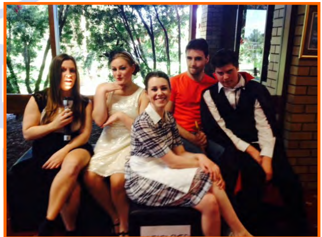
Year 12 Drama Examination Students

God of Wisdom, help me to keep things in perspective and not to worry about the exams or to care too little. When pressure overwhelms me, remind me that you hold my future in your hands, and that all does not rest on the result of this study. Help me to manage my time well, to make time to rest and play as well as study. Help me to revise effectively, and to remember all that I have studied during the exam. May I always give you the glory for all that I am and do. Amen.