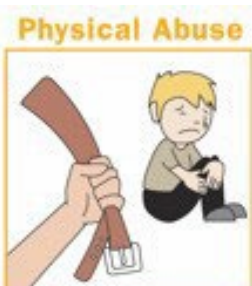
Harm to Your Body that Makes You Feel Pain

Physical Violence – When someone hurts your body, such as punches you or roughly grabs you.